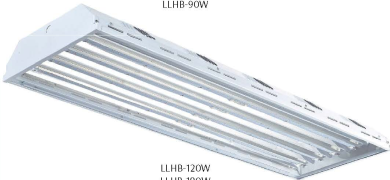
LLHB-120W LLHB-180W LLHB-240W